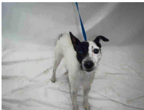
Save the Date